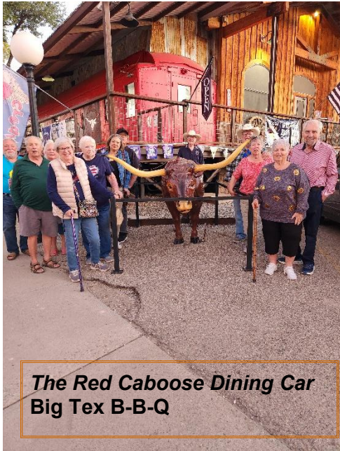
The Red Caboose Dining Car Big Tex B-B-Q