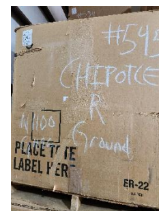
CHIPOTLE MEXICAN FOOD CHILI ORDER