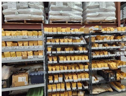
OVER 300 VARIETY CHILI SEED FOR BREEDING & PLANTING