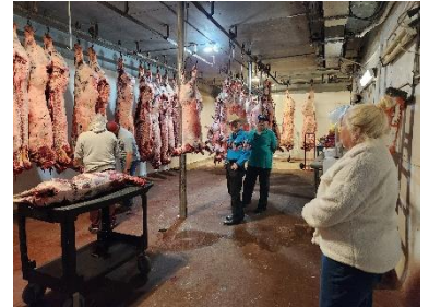
RAFTER M MEATS - WILCOX MEAT PACKING HOUSE