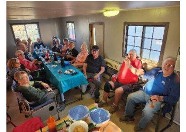
FT WILCOX RV PARK CLUB HOUSE