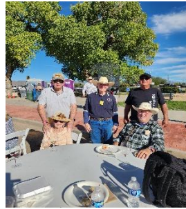
Wilcox Country Craft Fall Festival