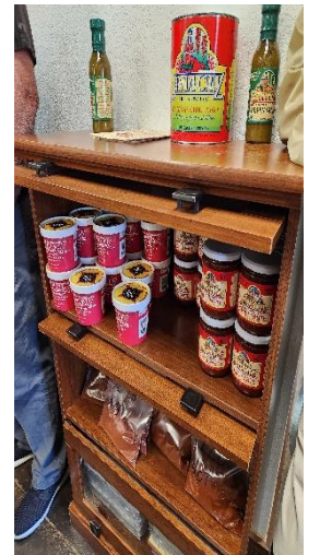
SANTA CRUZ CHILI - TUMACACORI, AZ CHILI ORDER